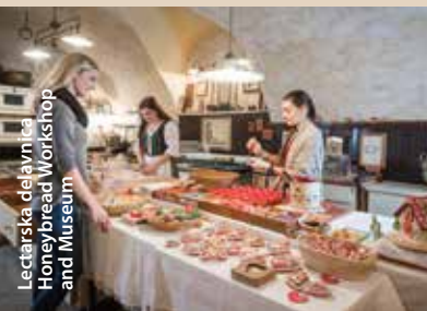
Lectarska delavnica Honeybread Workshop and Museum