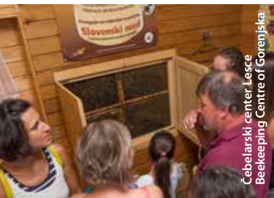
Čebelarski center Lesce Beekeeping Centre of Gorenjska