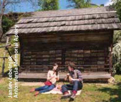
Janšev čebelnjak Anton Janša Memorial Apiary