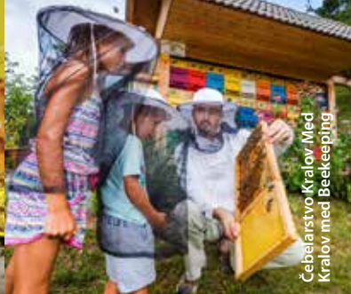
Čebelarstvo Kralov Med Kralov med Beekeeping