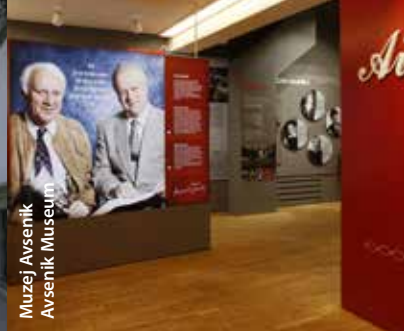
Muzej Avsenik Avsenik Museum

Meeting point: Birth House of Matija Čop