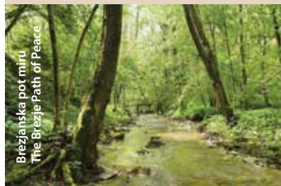
Brezjanska pot miru The Brezje Path of Peace