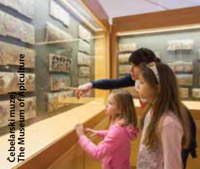
Čebelarski muzej The Museum of Apiculture