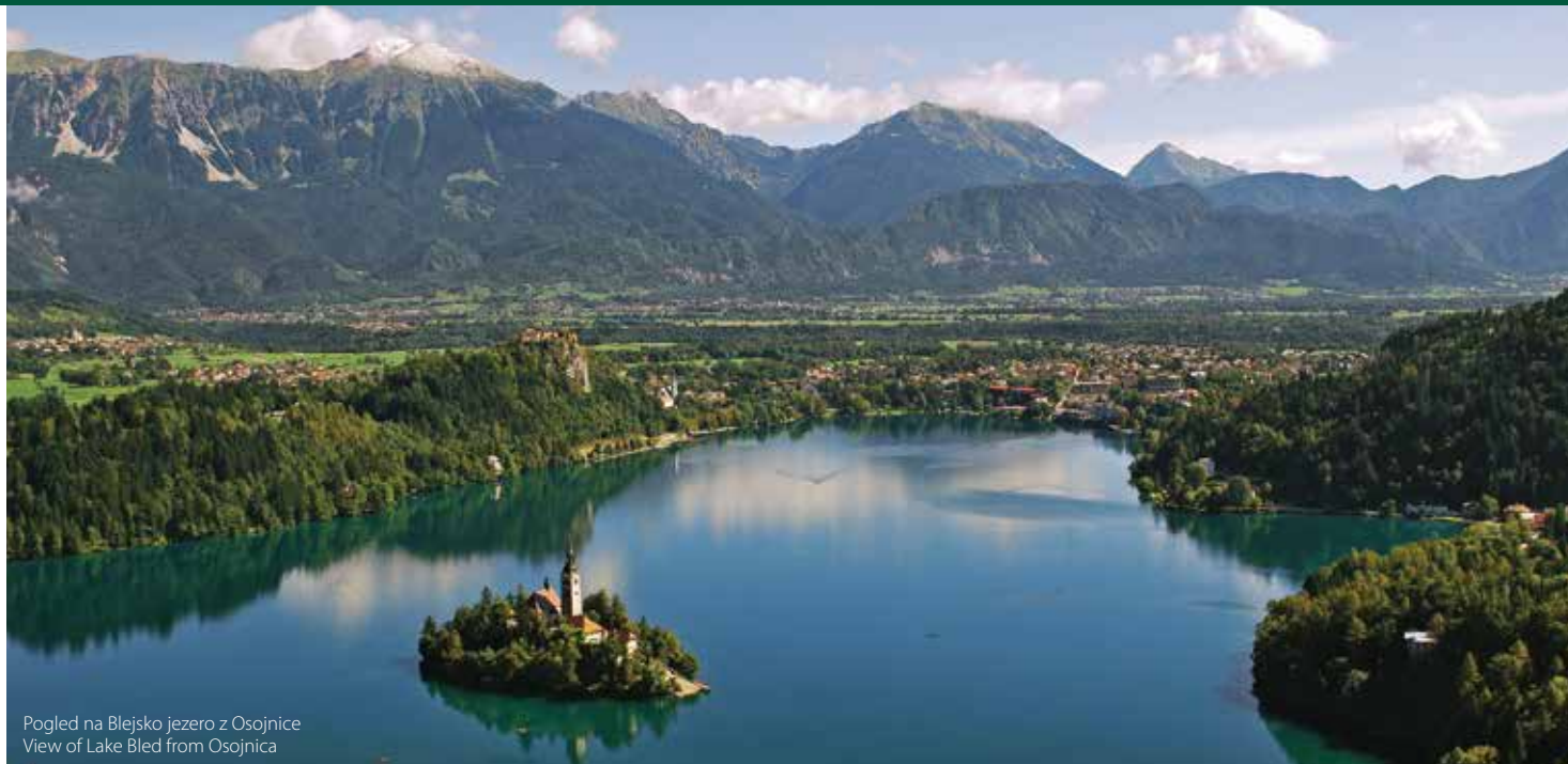
Pogled na Blejsko jezero z Osojnice View of Lake Bled from Osojnica