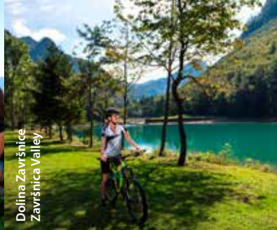
Dolina Završnice Završnica Valley